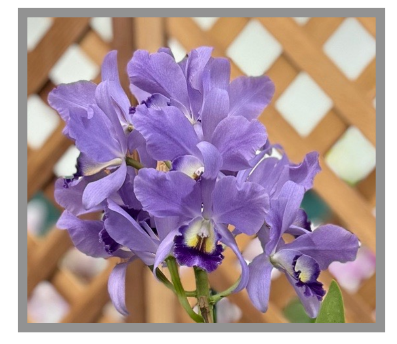
Ctt. Blue Boy 'Gainsborough' HCC/AOS