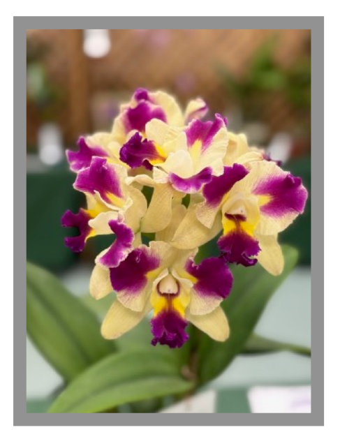
Blc. San Diego Hot Strike