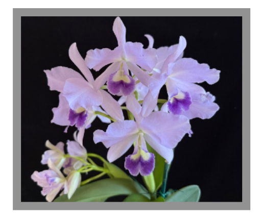
Ctt. Blue Boy 'Malibu'

We look forward to seeing you on December 4th.