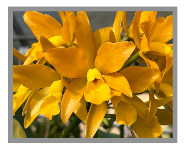
Slc. Golden Wax 'Lone Star II' HCC/AOS