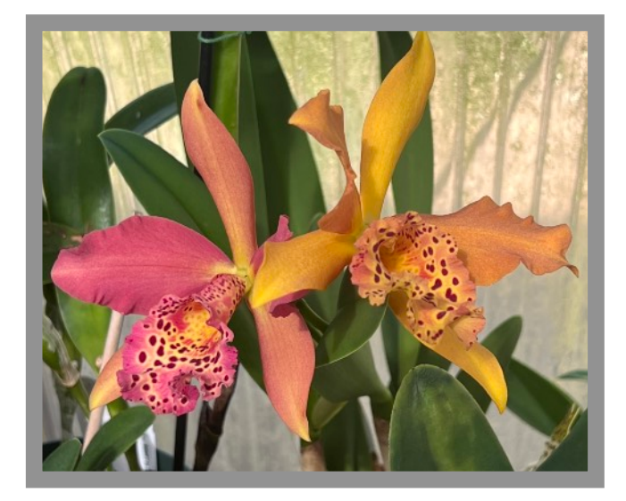
Rhynchobrassoleya Copper Queen 'H&R'